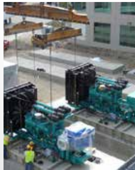
Digital Realty Trust, Carrollton TX