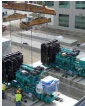
Digital Realty Trust, Carrollton TX