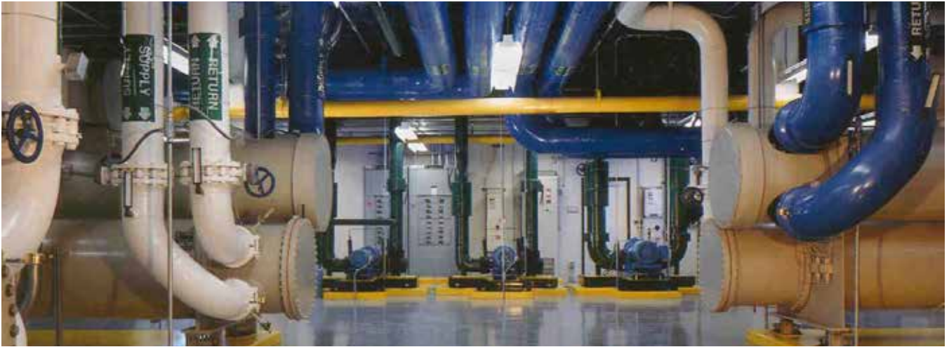
Burlington Northern Sante Fe Railway Headquarters, Fort Worth TX