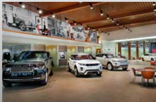
Plaza Jaguar, St. Louis MO