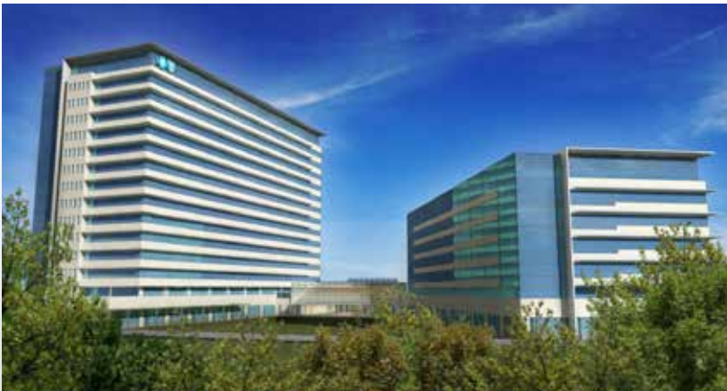
BlueCross BlueShield Headquarters, Richardson TX