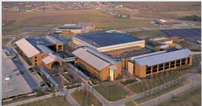
Burlington Northern Sante Fe Railway Corporate Campus, Fort Worth TX