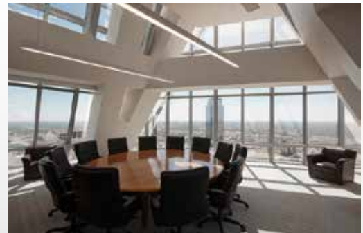
Tenet Healthcare, Fountain Place, Dallas TX