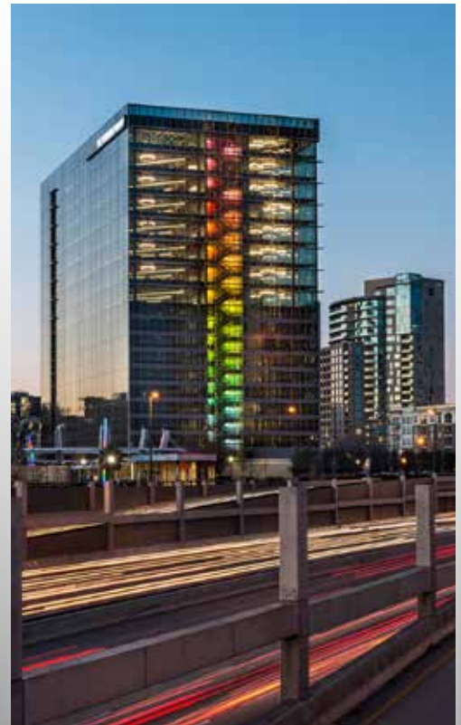
The Richards Group, Dallas TX